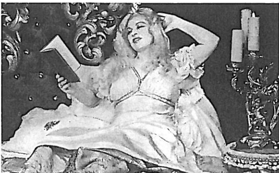
MAE WEST became a Todd star in her own play, Catherine Was Great . She played role as a kind of imperial version of "Come up and see me some time."