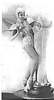
FLAME DANCER Page was an early star for Todd.